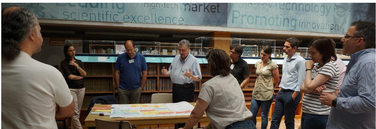
Figure 4: Fruitful and Vibrant Discussions among Project Teams

The first working session was dedicated to the reflection on motives, incentives and experiences of the participants in commercializing R&D results. The second working session addressed the alignment amongst the project members in terms of the envisioned project results, project context (problem and proposed solution) and prioritizing potential market applications. The fruitful and vibrant discussions in the project teams indicate that the alignment among the project partners supports the potential commercialization of R&D results. It became clear that a shared understanding and alignment among team members is an important enabler for the development of a common transfer vision.