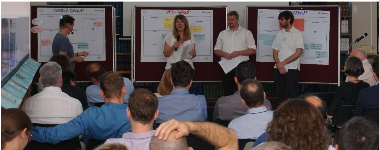
Figure 5: Reflection of the Workshop Results in the Plenum

Furthermore, knowledge and technology transfer as well as exploitation of R&D results is a complex process. Due to the underlying context dependency, “one-size fits all solutions” are not applicable. To this end, the third working session focused on the necessary next steps to transfer publicly funded R&D results in useful applications in economy, politics and society. The project teams were encouraged to discuss and define the exploitation goals, specific user groups and key resources needed to reach their goals. The discussions among projects members helped formulate or to get closer to a shared vision with regard to the future practical application of the jointly generated R&D results.