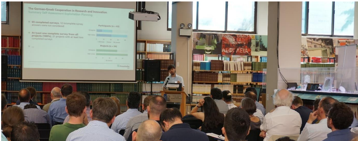
Figure 3: Setting the Scene - Introduction to the Workshop Approach

of the self-assessment. The following two days have been structured in three sessions: (1) Reflecting the willingness and capabilities to transfer of the individuals involved in the collaborative projects, (2) aligning the individual perspectives by creating a shared vision of the project context and potential market applications as well as (3) critically reflecting on the commercial context and to derive practical next steps to be taken by the project teams. In a friendly and vibrant atmosphere, the project teams were given the opportunity to reflect on transfer aspects of their respective projects in an innovative and very interactive way.